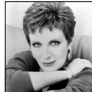
Acclaimed Recording Artist Maureen McGovern